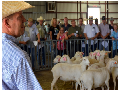
Texas Sheep And Goat Expo. August 17-18 San Angelo, TX TEXAS A&M AGRILIFE RESEARCH AND EXTENSION

EXPO: Adult registration is $40 and youth registration is $15. The fees include all meals, snacks and educational materials associated with the expo. Online registration ends Aug 14th, though registration will still be available at the field day and again at the door at the expo.