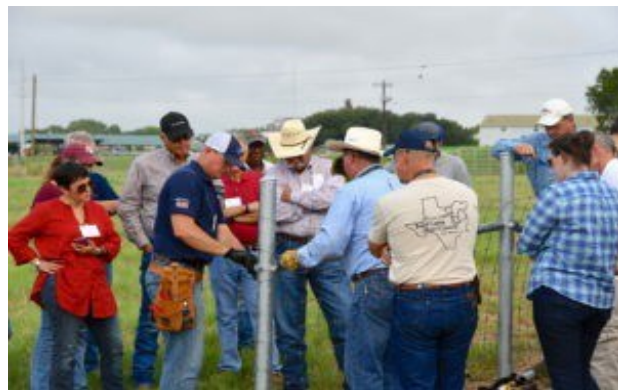
A fence building demonstration will be held as part of the 64th Texas A&M Beef Cattle Short Course Aug. 6-8 in College Station.

The short course is the largest beef cattle educational event in the country and attracts more than 1,600 beef cattle producers from Texas and abroad, according to organizers. The short course is hosted by the Texas A&M AgriLife Extension Service and the department of animal science at Texas A&M.